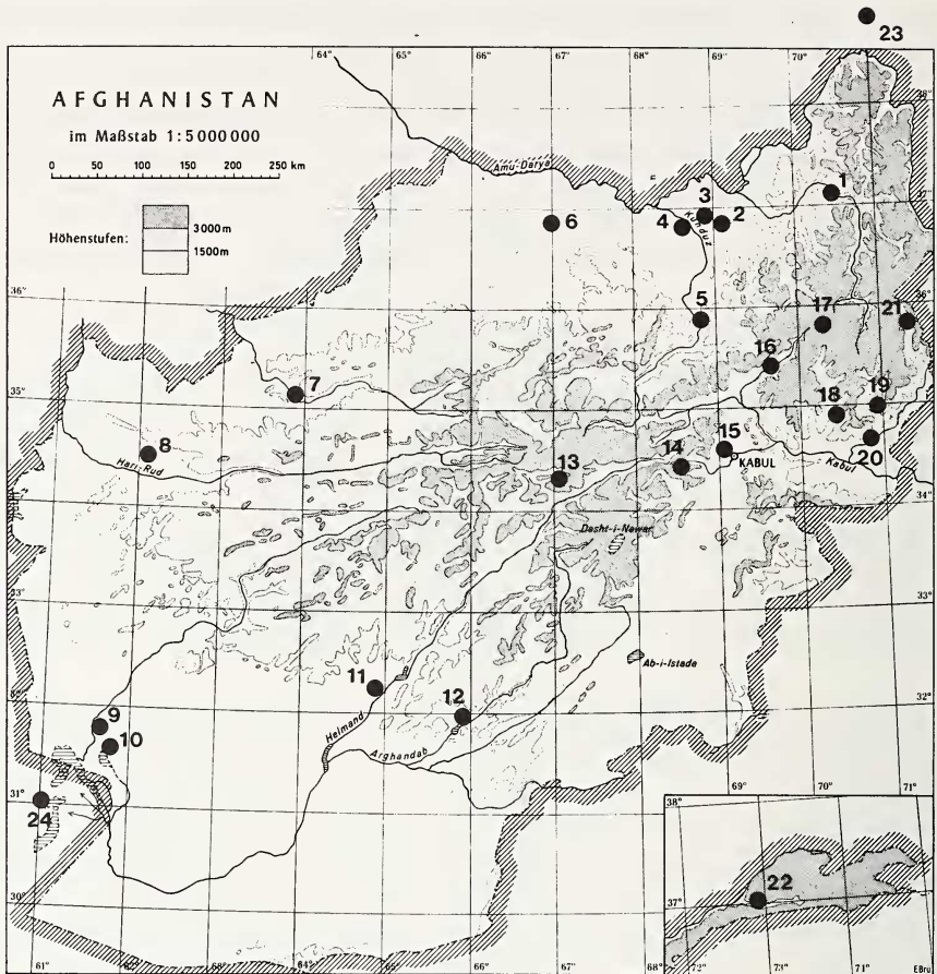
Fig. 2: Distribution of the Eurasian Otter Lutra lutra in Afghanistan. For locality references see text.

that even furriers admitted a decrease of otter fur supply. Chaudry (1991) emphasized the conflict between L. lutra and trout fisheries in the aforementioned areas since 1950, leading to government bounties offered for killed otters. Bounties were withdrawn in 1970. L. lutra reportedly shows seasonal migration behaviour in Kashmir, following spawning carps up to 3600 m or more in summer and descending again in winter (Prater 1980). For the Irani-Afghanian border, Misonne (1959) referred to the Seistan otters in the note of Birula (1912), not giving any new information. According to Novikov (1956) L. lutra was very rare in Uzbekistan east of Samarkand on the Zeravshan River, but Ognev (1931) listed the species as being quite abundant in Turkestan. The latter author also reported the high value of otter pelts fetched among the Kirgizians. Due to time constraints, other literature on otters from the former Soviet Central Asian republics (Romanovski 1991) was not consulted.